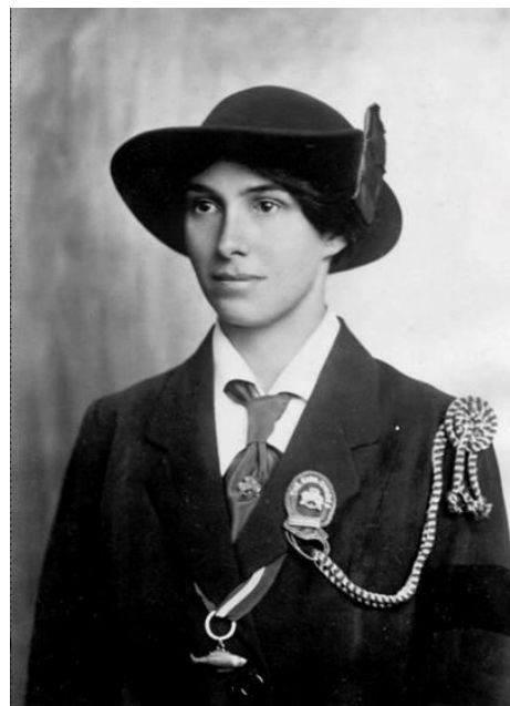
Olave Baden-Powell as World Chief Guide (a)

Six years later, at the 7th World conference in Poland 3 , a delegate from Belize suggested that as birthdays traditionally involved gifts, Thinking day could be used to raise money for the Girl Guide and Girl Scout movement. Olave Baden-Powell asked all Guides to donate one penny, enough to buy a loaf of bread. This was the beginning of the World thinking day fund 4 which still exists and is used to support girls across the world in the WAGGGS (World Association of Girl Guides and Girl Scout) movement 5 .