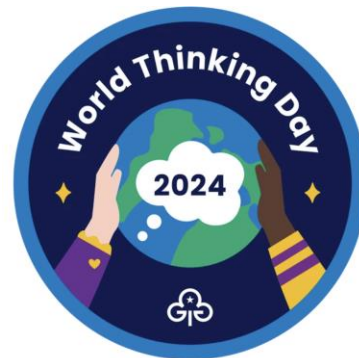
The GirlGuiding UK