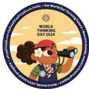
The WAGGGS UK World Thinking Day

This year the WAGGGS theme is 'Our World, Our Thriving Future'. Within my units this year we have decided not to complete the challenge pack, opting instead to carry out our own activities reflecting on Guiding around the world. With my Rainbows unit we are going to think about other countries where there are Rainbows and Brownies and then play games and make textured pictures of things from those countries. Whatever you choose to do and however you and your units celebrate -